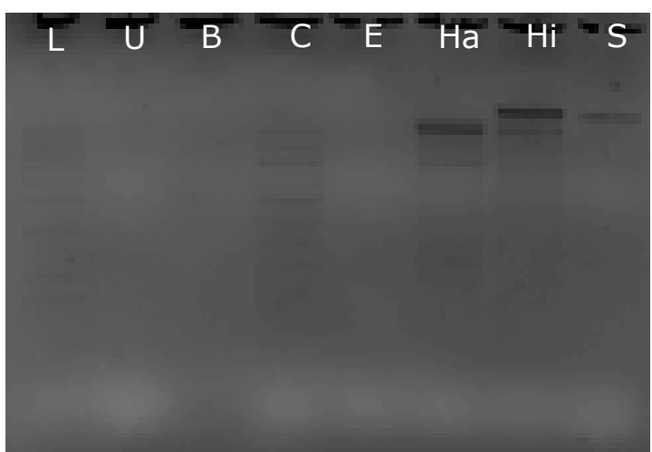
SAME restriction digest, I only inverted the image to better see the bands that each enzyme cut