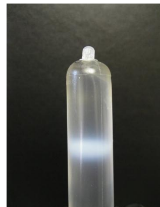
Figure 2: Example of a photograph documenting a CsCl band.