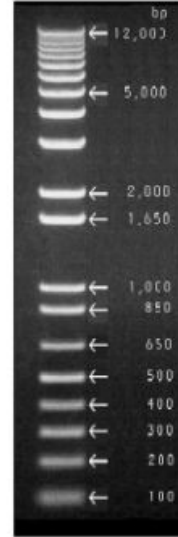
1 Kb PLUS DNA LADDER 0.7 µg/lane 0.9% agarose gel