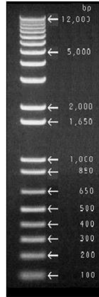
1 Kb PLUS DNA LADDER 0.7 µg/lane 0.9% agarose gel