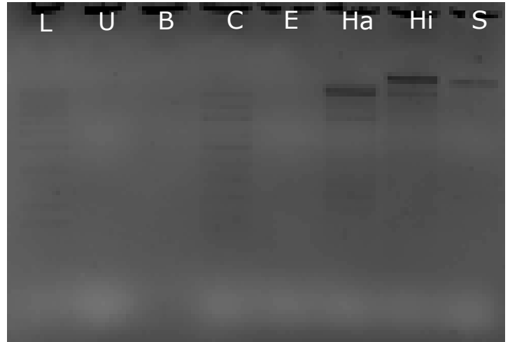
SAME restriction digest, I only inverted the image to better see the bands that each enzyme cut